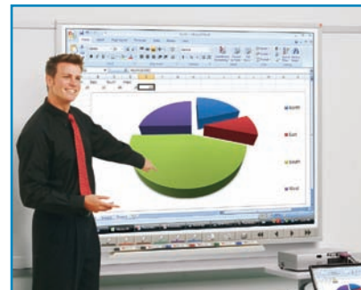
Pressure sensitive surface for finger touch operation.