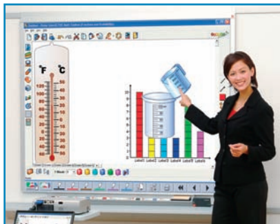
Leaderboard 77 comes with either mobile or fix mounts